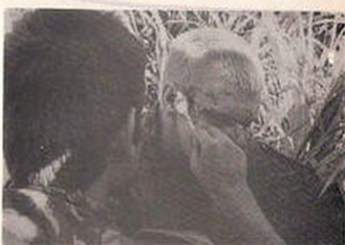
An army driver, injured in a latrine explosion received first aid from a colleague. He later lost the use of his right eye altogether.