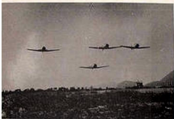
A group of Harvard T6 aircraft of the Portuguese Airforce take off from Munda.