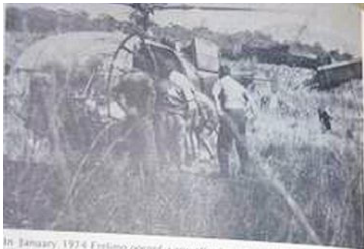
In January 1974 Frelimo opened a new offensive at the Inharrim area to win the area line which ran from Inharrim to Mutarara. Here casualties are being treated in a hospital while the detailed train lies crippled in the background.