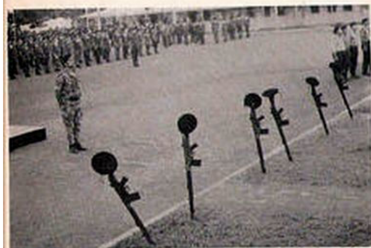
The ceremony for the dead of the 2043 Commando Company.