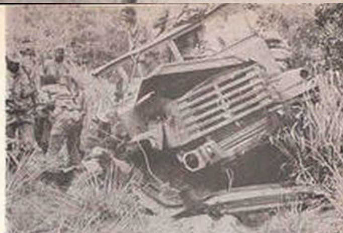
A jeep Bellini was crippled on a bush track after detaching a Soviet made anti-tank mine. Like thousands of other articles it was wrecked by one of the terrorist's atrocious weapons.