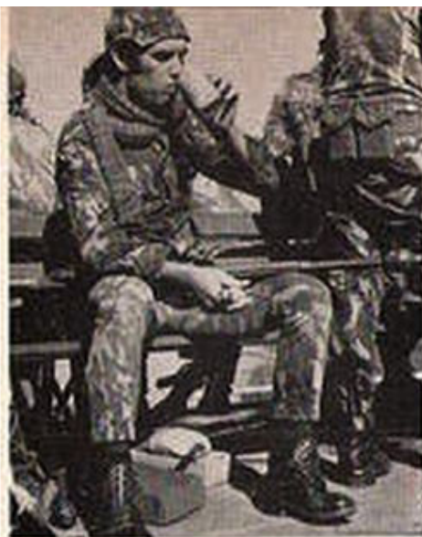
A moment of rest for the Commando of the 2043 - the "Justicinos".