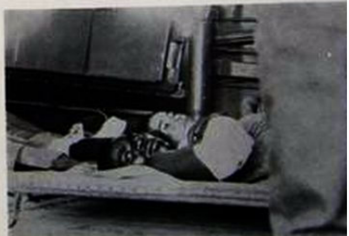
Black and White soldiers like small treatment after being injured in an attack.